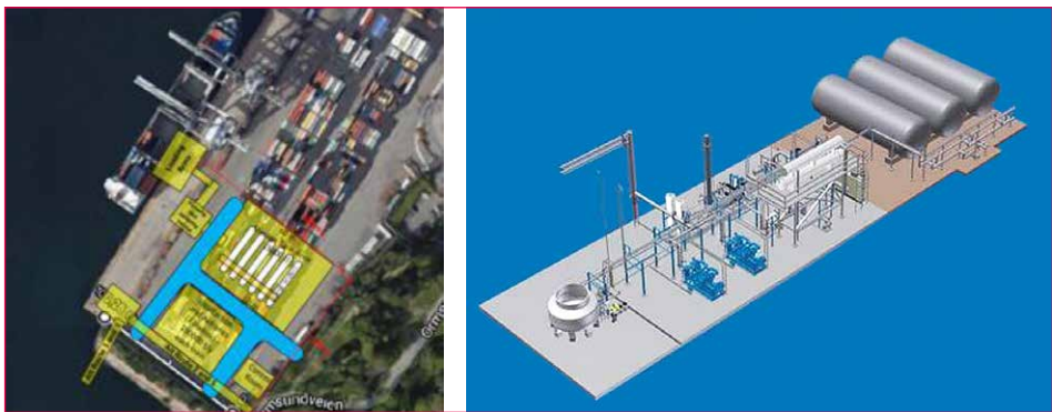
Figure 3: View of possible location at Ormsund Quay with intermediate (left) and typical small-scale CO 2 storage facility (right)

Rail transport from Klemetsrud to a shared storage in Grenland is not considered realistic because of the number of logistics operations between Klemetsrud and Grenland.